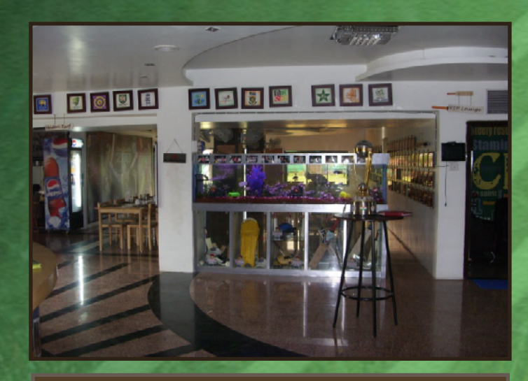
Above and Below, The Sports Museum