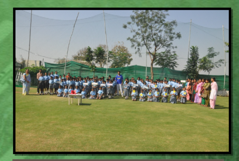
Above the junior school at their sports day. Below, learning the Montessori way