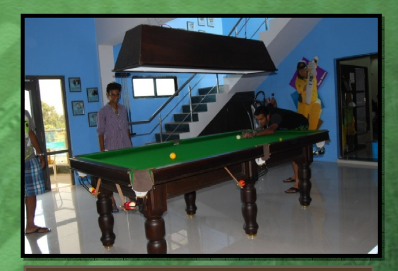
Above and Below The Recreation Area