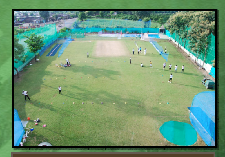
Above The Practice Area, below The Dining Area and Museum Dedicated to Sports Stars